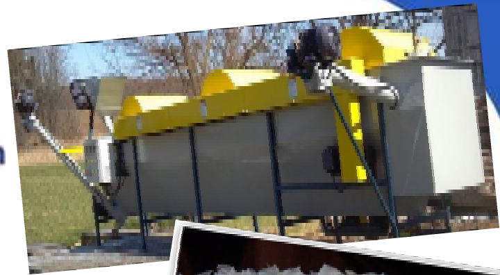
Sink Float Tank

American Cierra is an industry leader in the recycling process, with approved Patents and more pending. Our low cost plastic recycling Wash Lines separate the plastic by density, and then reprocesses this plastic into clean reusable materials. The process is automated to meet your production needs, efficient and proven.